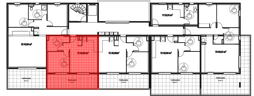
Plan d'étage courant R+2