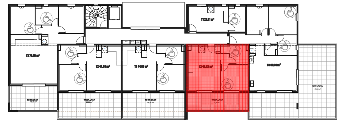
Plan d'étage courant R+1