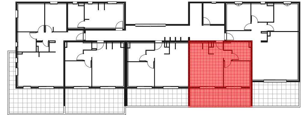
Plan d'étage courant R+3